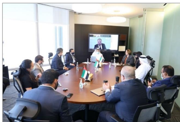
First UAE ARISE Network meeting.